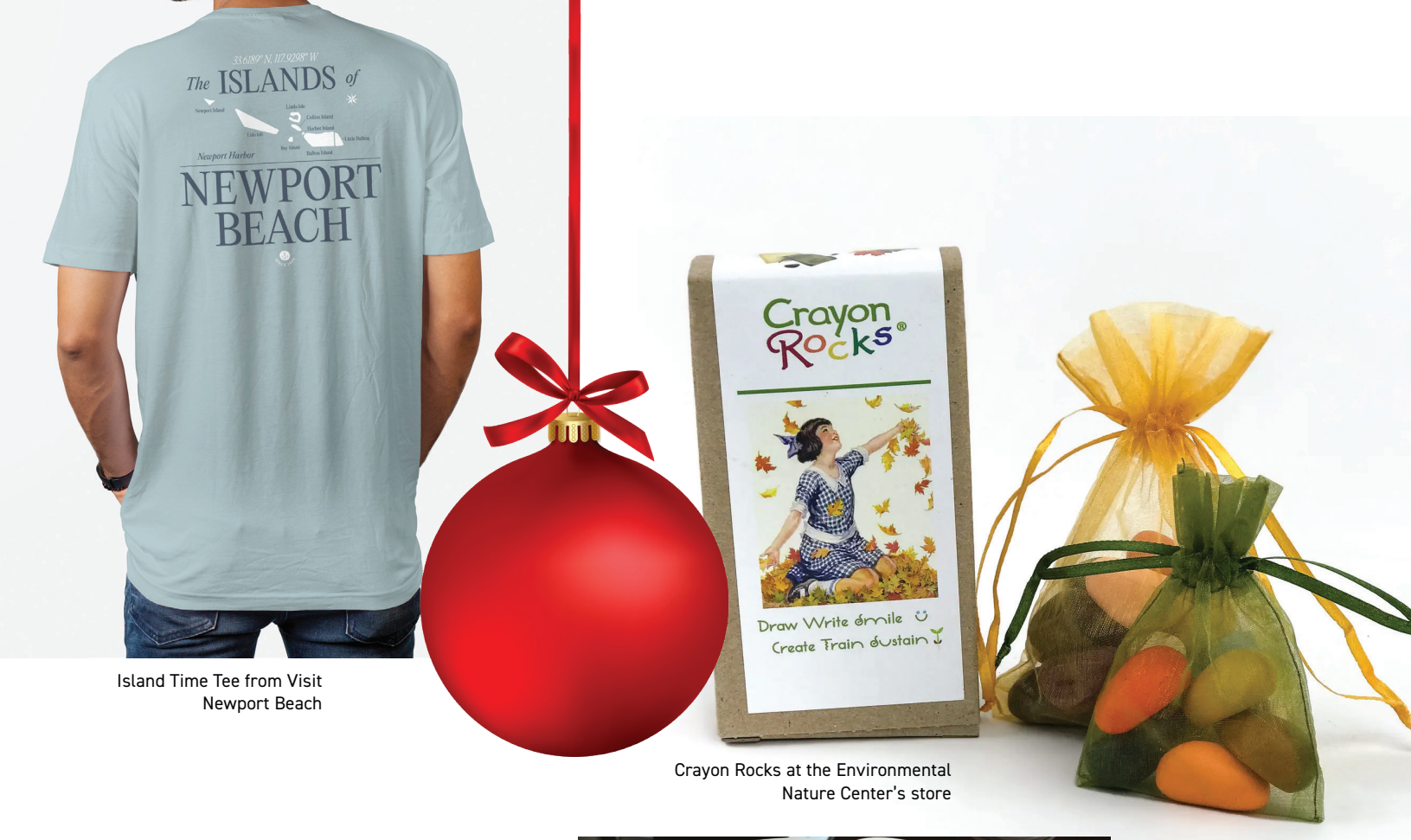
Island Time Tee from Visit Newport Beach