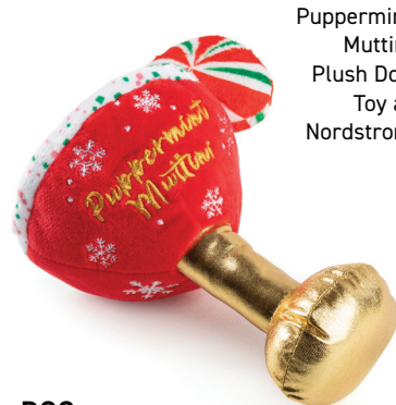
Puppermint Muttini Plush Dog Toy at Nordstrom

TOP LEFT: COURTESY OF NEWPORT COASTAL ADVENTURE