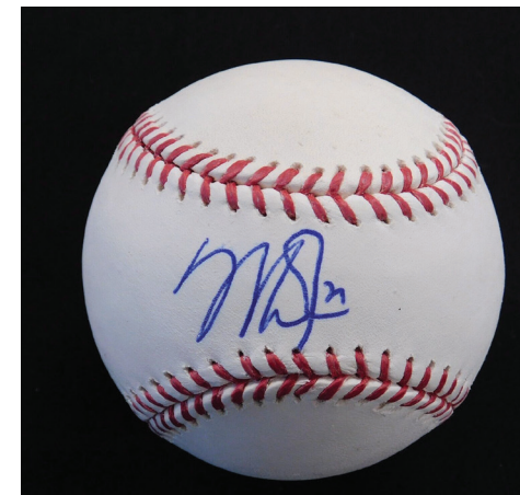
Above: A baseball signed by Mike Trout of the Los Angeles Angels at LCG Signatures; far left: a bag of Mexico Veracruz single-origin coffee beans from Freelance Coffee Project

Any baseball enthusiast will appreciate an AUTOGRAPHED MAJOR LEAGUE BASEBALL , like this one signed in blue pen by Mike Trout of the Los Angeles Angels of Anaheim and certified by MLB, $550. It's just one of hundreds of signed baseballs by various other major leaguers available at LCG Signatures. (949-863-9697; lcgsignatures.com)