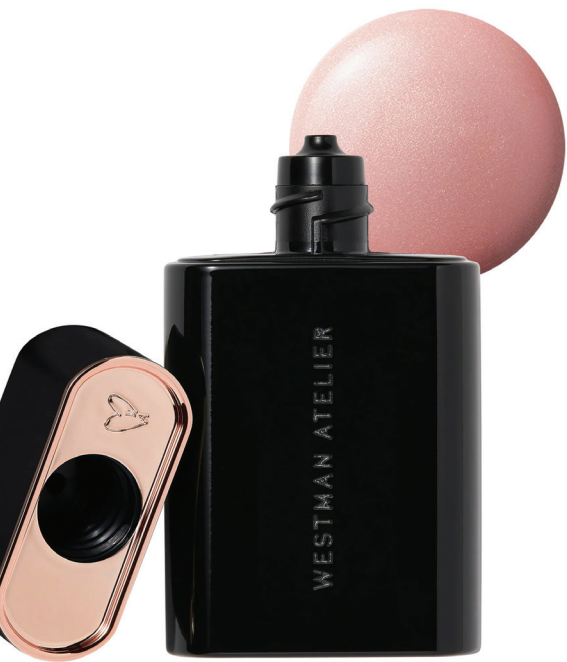
From left: Liquid Super Loaded Drops at Cos Bar; a Vivid Chrysanthemum Print Scarf at St. John