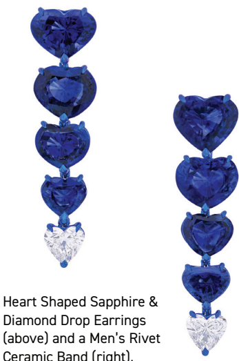
Heart Shaped Sapphire & Diamond Drop Earrings (above) and a Men's Rivet Ceramic Band (right), both at Lugano Diamonds