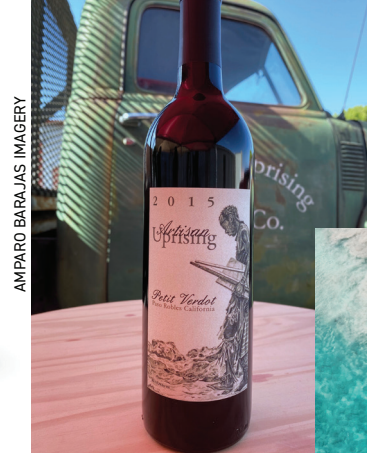
AMPARO BARAJAS IMAGERY

Pizza night is more fun than ever with the Cuisinart INDOOR PIZZA OVEN , which allows you to create your own pies with ease. Your favorite home chef will never want to order delivery again: Layer sauce, cheese and toppings on freshly rolled dough, place it on the pizza stone and pop it in the oven, which has a large viewing window so you keep an eye as it cooks; with temperatures rising to between 350 and 700 F, you can craft everything from thin crust to deep dish, $399.95, with advance order at Sur La Table, Corona del Mar Plaza. (949-640-0200; surlatable.com)