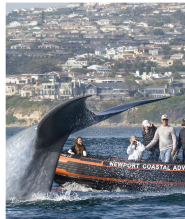
Gift cards are available for whale-watching trips with Newport Coastal Adventure