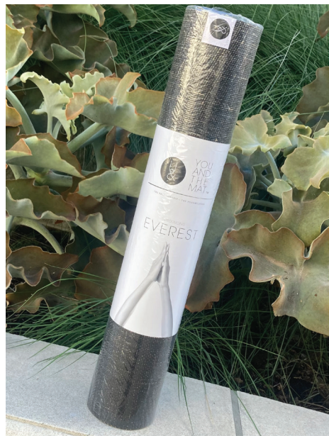
Left: St. Bart's Seascape fragrance set at Tommy Bahama; above: the Everest Mat at LiveMetta Newport Beach

Get your sweat on using LiveMetta's own EVEREST MAT , a sustainable option made with interwoven jute fibers and natural tree rubber, which allow for better traction and durability of its textured surface; the open cell construction also aids in absorbing excess sweat for even better grip, $89, at LiveMetta Newport Beach, Westcliff Plaza. (949-646-8600; livemetta.com)