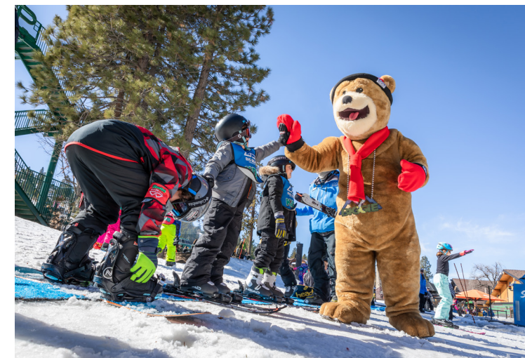
Opposite page: exploring the slopes at Big Bear Mountain Resort; this page, from top: a fire pit for warming up after skiing; Biggie the Bear high-fives a student