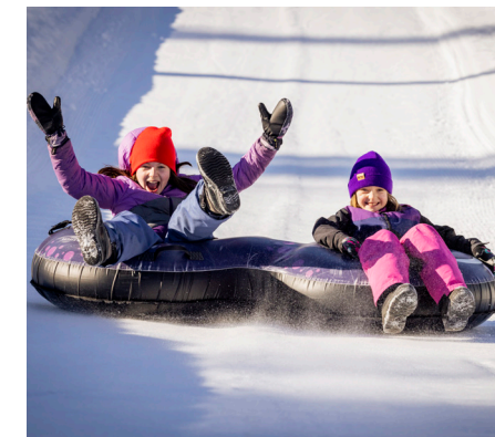
Clockwise from top left: skiers and snowboarders hitting the slopes at Whistler Blackcomb; skiing down one of the slopes; a fun ride down the tubing hill; warming up around the fire after a day on the mountain; an ice cave in Whistler, a unique feature that has ski-in/ski-out access from the resort