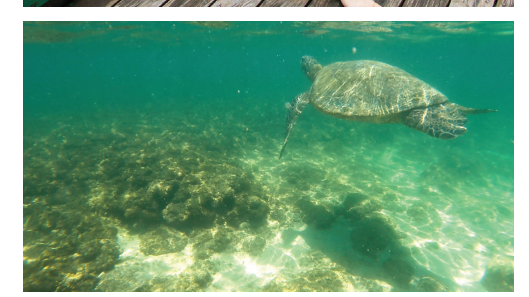
Top: a performance of "Hawaiian Wedding Song" at Kauai's Fern Grotto; bottom: a sea turtle from a Maui snorkeling trip

On the Big Island, wander the downtown Hilo area to find a number of shops and art galleries; this is the perfect spot to buy gifts for loved ones back home or snacks for the rest of your journey. The Hilo Farmers Market offers everything from lychees, apple bananas (small, sweet bananas grown on the islands) and bouquets of fresh tropical flowers to jewelry, clothing and other crafts. On the other side of the island, you'll find Kona is very walkable. Trendy shops galore offer fun gifts and souvenirs of your trip, but you'll also find a few historic places right near the spot where your tender boat arrives. Hulihee Palace, formerly a vacation home for Hawaiian royalty, has been turned into a museum that can be toured. Down the