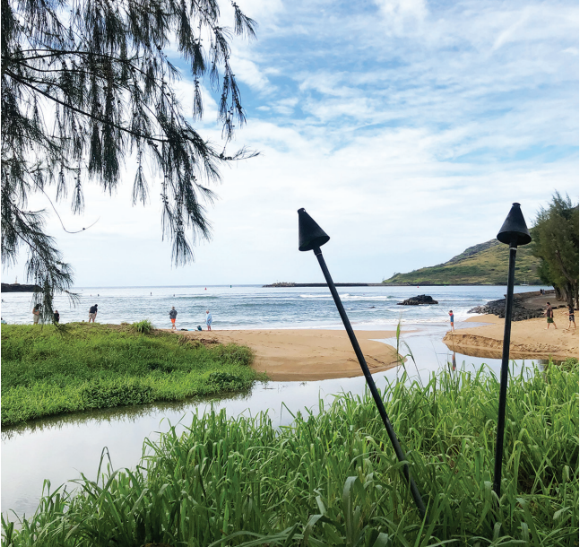
Left to right: Excursions include a variety of activities including the opportunity to swim under a waterfall.; Kalapaki Beach on Kauai

excursions are a fantastic way to see the Hawaiian islands without having to worry about doing any planning: Simply book and go.