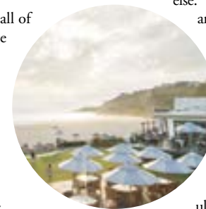
Monarch Bay Club

anytime in spring, summer or fall, but says winters tend to get chilly here.