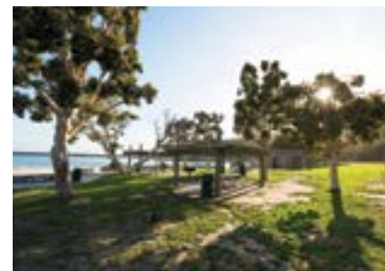
Dana Point Harbor's Baby Beach

For those that would prefer to stay on property for their picnic excursion, Alpert recommends the resort's private beach. Located just steps away from the resort, underneath the coastal bluffs that Dana Point is known for, this is a beautiful place to soak up the sunshine or watch a colorful sunset. Alpert says attendants are waiting to provide you with everything from chairs to towels once