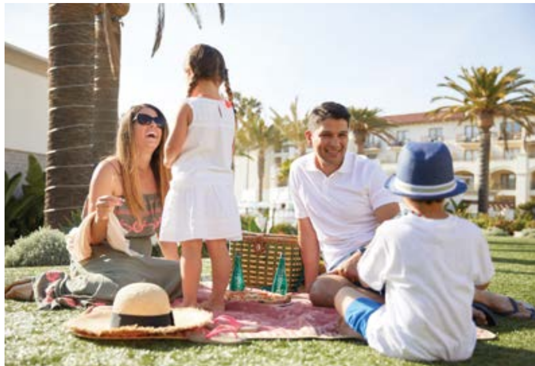
Orange County has a plethora of places to host your own picnic.

While red and white checkered blankets topped with potato salad and a giant jug of sweet tea are, for the most part, a thing of the past, picnicking is alive and well—especially in a place as beautiful as Orange County.