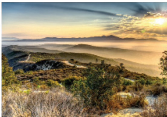
Hike at Top of the World for impressive views of the rolling hills.

and watch the sun set behind Catalina Island," he says of the cafe, which offers a patio as well as portable fire pits that can be rented to roast marshmallows on the beach. "Another surreal spot for a sunset takes a bit of energy, but the payoff is huge: Try the Valido Trail , part of OC Parks' trail system [in Aliso and Wood Canyons Wilderness Park] that ends up 600-plus feet above our south Laguna beaches. Watching the sunset from here is beyond incredible."