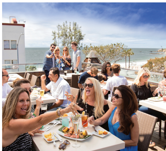
The rooftop view from Skyloft, located near Main Beach