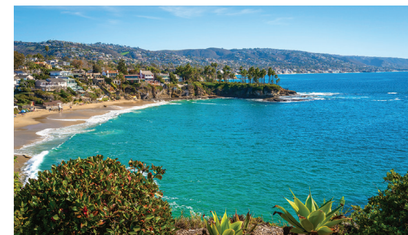
Crescent Bay Beach in north Laguna is great for snorkeling or exploring tide pools.