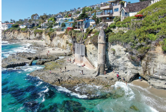
The "pirate tower" makes Victoria Beach a really unique spot.

Farther south, a different set of beaches offers more natural beauty to explore. At Wood's Cove , venture slightly north and you'll find the only blowhole in Orange County while the waves on the south end are ideal for skimboarding.