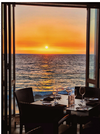
Enjoy sunset views at Splashes Restaurant.

or anniversary celebration—or any night, really—Splashes serves up picturesque views along with standout dishes from lobster bisque to fresh oysters, seared scallops, filet mignon and rack of lamb.