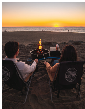
Roasting marshmallows at Lost Pier Cafe