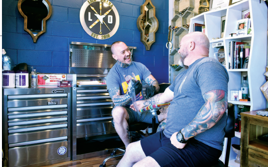
LO CAL TATTOO STUDIO

The first of its kind in Laguna Beach, reDefined offers full-body, resistance-based workouts on the XFormer, a modernized reformer. Safe and effective, the high-intensity yet low-impact sessions build strength while simultaneously increasing flexibility. The classes are all private or semiprivate and can be booked via the website, which also has a shop that sells Pilates-related gear.