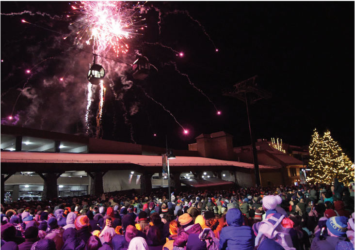
Left: Apres-ski options abound; right: a festive atmosphere with fireworks at Heavenly

While the majority of runs at Kirkwood Mountain Resort are advanced or expert, they do have more offerings for beginners than Heavenly. Explore the 2,300 acres of terrain on your own or with Expedition:Kirkwood, a variety of clinics, private guides and more to get skiers and snowboarders to the next level. In part, the program aims to get travelers out in the backcountry that sits within resort boundaries and is reachable by ski lift. Known for its stunning views of the mountains, this is a great