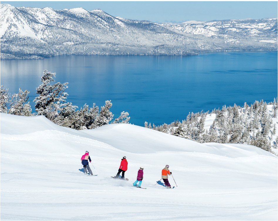
Surrounded by high-elevation peaks, Lake Tahoe stands out in the U.S. for having the most ski areas in a 100-mile radius.