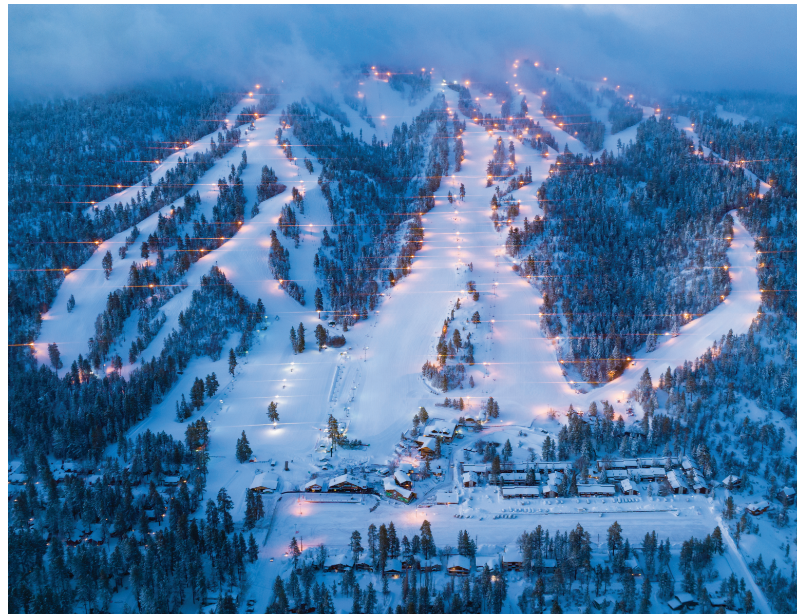
Snow Summit, within Big Bear Mountain Resort, originally opened in the 1950s and now boasts 240 acres of skiable terrain.