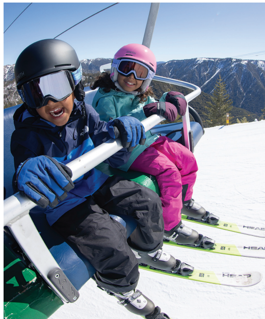
Big Bear Mountain Resort offers something for everyone with plenty of trails for beginner, intermediate and advanced skiiers and snowboarders.