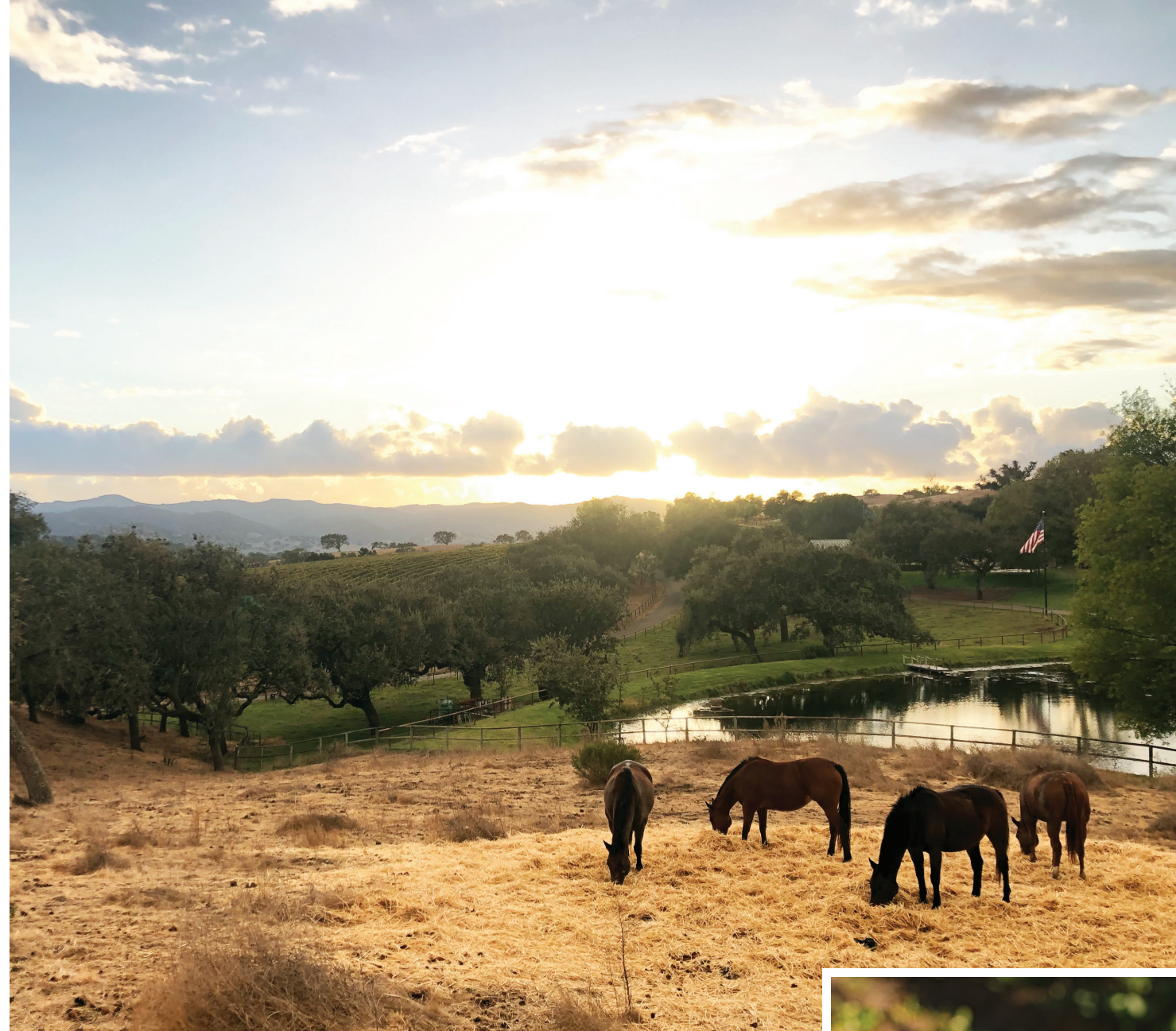
Above: Dovecote Estate Winery's bucolic setting; right: fresh dishes at Vega Vineyard & Farm