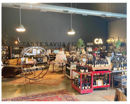
Eclectic vintage decor offers much to explore at Babcock Winery & Vineyards.

With fun names like Status Crow and Opportunity Knocks carignan, Ocean's Ghost pinot noir, Once in a Lifetime viognier and