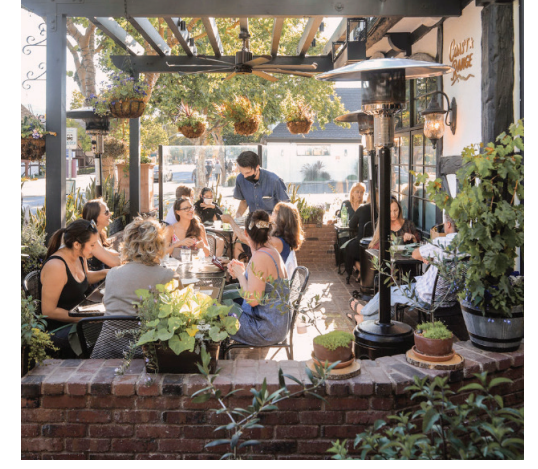
A patio and kid-friendly menu options are great for families at Coast Range.

Diners can't go wrong with any of the menu items, but the French onion soup with truffle cheese gratinee is next level. Most of the menu is steaks (think bone-in rib-eye, wagyu tomahawk and filet mignon) and sides, but diners can also choose from oysters, shrimp scampi, chicken fried steak and miso-glazed cod. Those with children tagging along can rest assured