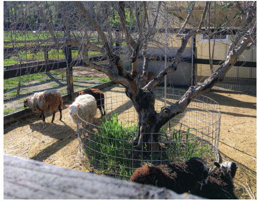
Top: The Landsby's courtyard features fire pits and s'mores kits can be purchased inside the hotel. Above: Kids can feed animals at Vega Vineyard & Farm. Below: Children will enjoy the open space and pond while adults sip vino at Dovecote Estate Winery.