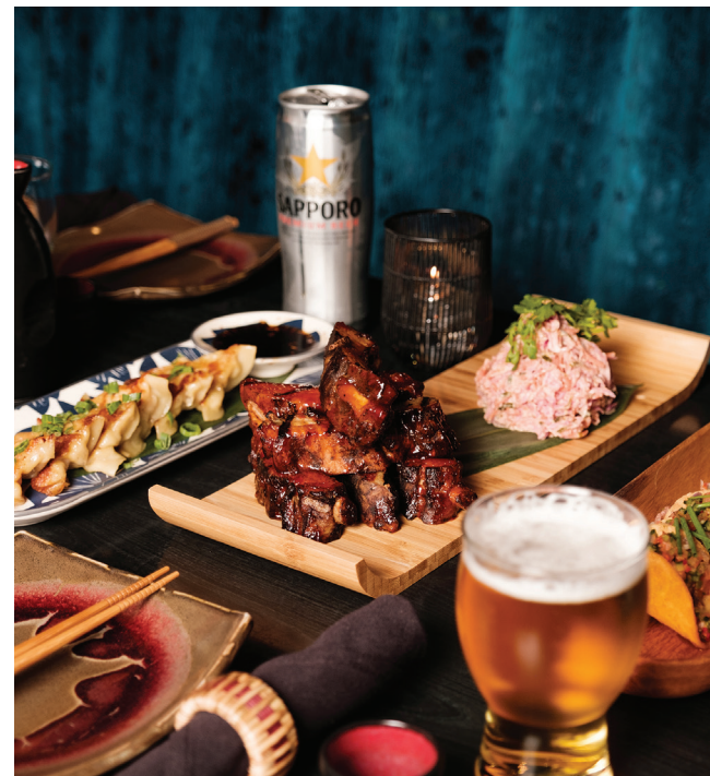
Participating OC Restaurant Week eateries, Starfish Laguna (above) and Rumari (below)