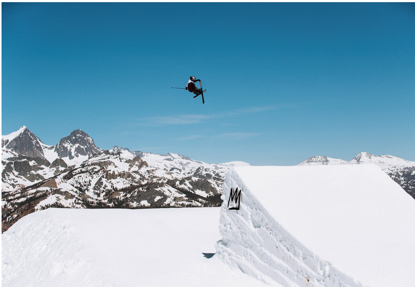
One of 10 unique terrain parks at Mammoth Mountain Ski Area

Elsewhere in Mammoth Lakes, enjoy drinks at Shelter Distilling in The Village, luxurious fare at The Brasserie (surprisingly, within a local bowling alley, Mammoth Rock 'N' Bowl), an intimate meal at Lakefront Restaurant on Twin Lakes, healthy snacks at Elixir Superfood & Juice, flights and bites at Mammoth Brewing Co., warm bowls at Gojira Ramen & Sushi, seasonal menus at Skadi or contemporary cuisine at Petra's Bistro & Wine Bar.