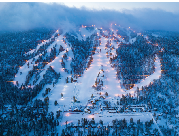
Big Bear Mountain Resort includes Snow Summit (top left and bottom row) as well as Snow Valley (top right) and Bear Mountain (opposite page), providing a variety of options for everyone from beginners to experts on the slopes as well as places to gather and dine afterward.