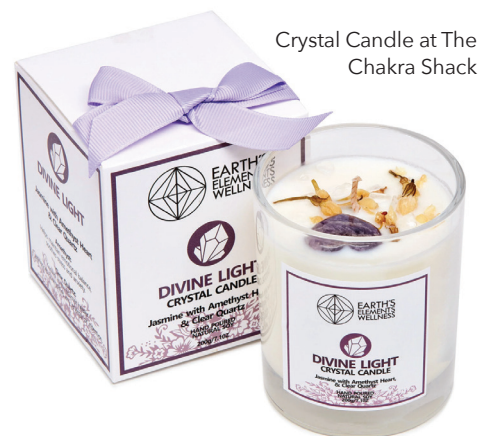
Crystal Candle at The Chakra Shack

Nothing helps to create a calm mood better than a softly scented candle flickering in the room. The Earth's Elements Wellness CRYSTAL CANDLE , made with hand-poured soy wax, essential oils and organic herbs, comes in scents from jasmine to coconut-vanilla. Each candle features a crystal that can be saved after the wax melts, from $29.95, at The Chakra Shack. (949-715-6930; chakrashack.com)