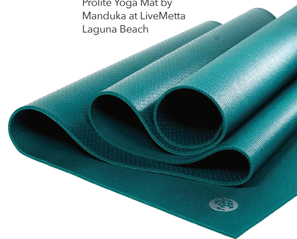
Prolite Yoga Mat by Manduka at LiveMetta Laguna Beach

The new LiveMetta yoga studio in town contains its own fitness-focused boutique, with gifts that are perfect for the holiday season. Aside from yoga blankets, exercise balls and grip socks, you'll find options like the PROLITE YOGA MAT from Manduka, which is lightweight and perfect for on the go while still offering cushioned support and nonslip texture, $108, at LiveMetta Laguna Beach. (949-416-3996; livemetta.com)