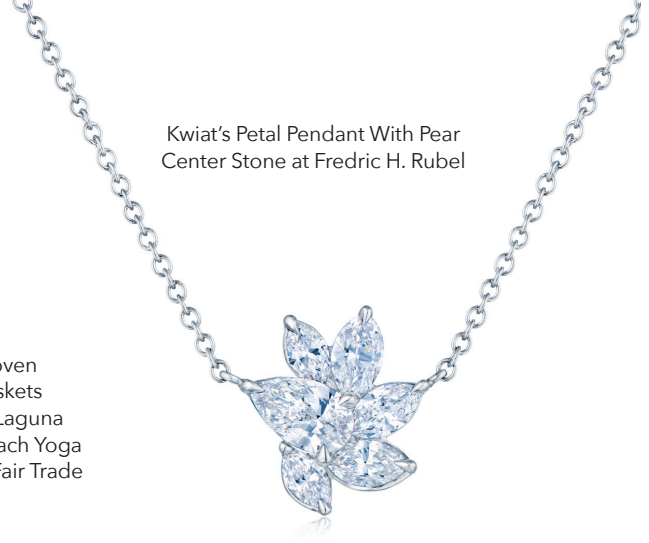
Kwiat's Petal Pendant With Pear Center Stone at Fredric H. Rubel