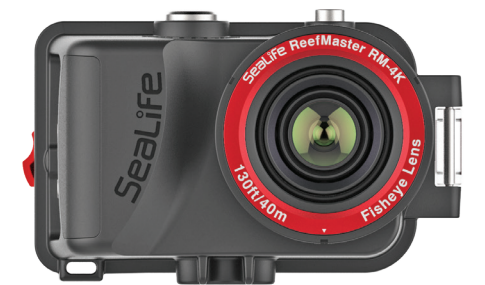
SeaLife's ReefMaster RM-4K camera at Beach Cities Scuba