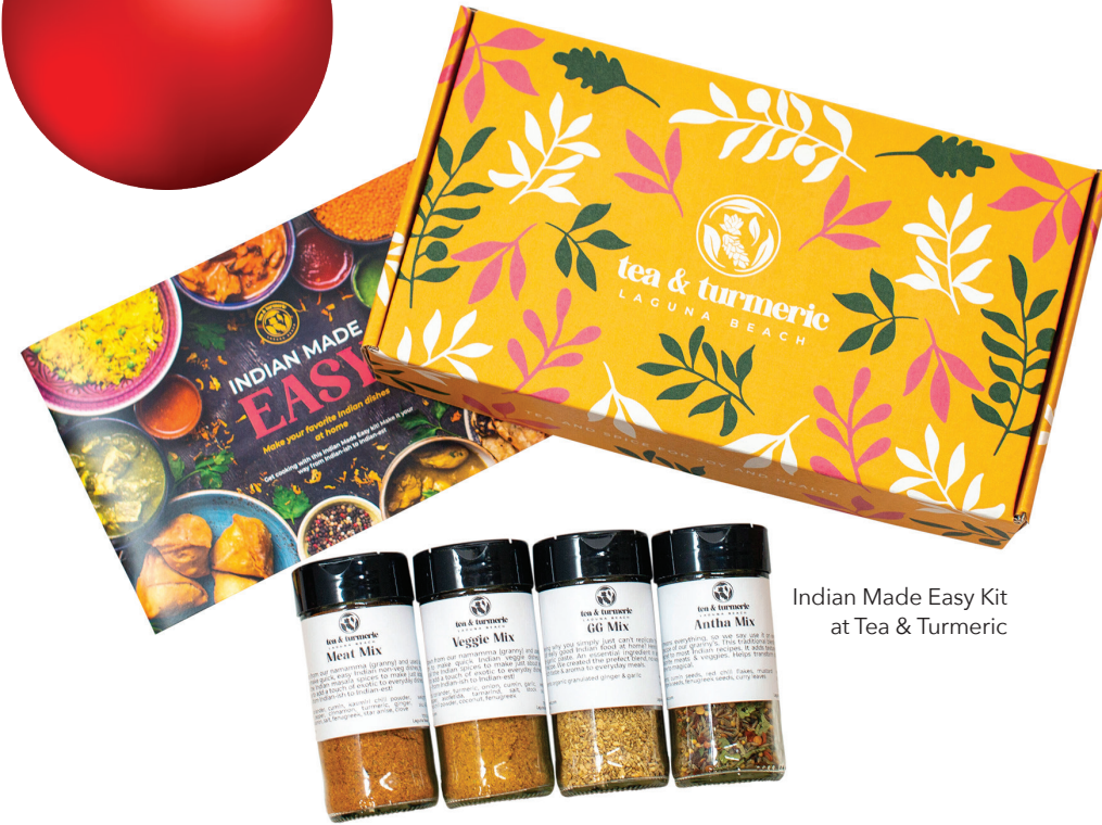
Indian Made Easy Kit at Tea & Turmeric