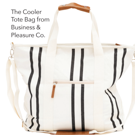
The Cooler Tote Bag from Business & Pleasure Co.