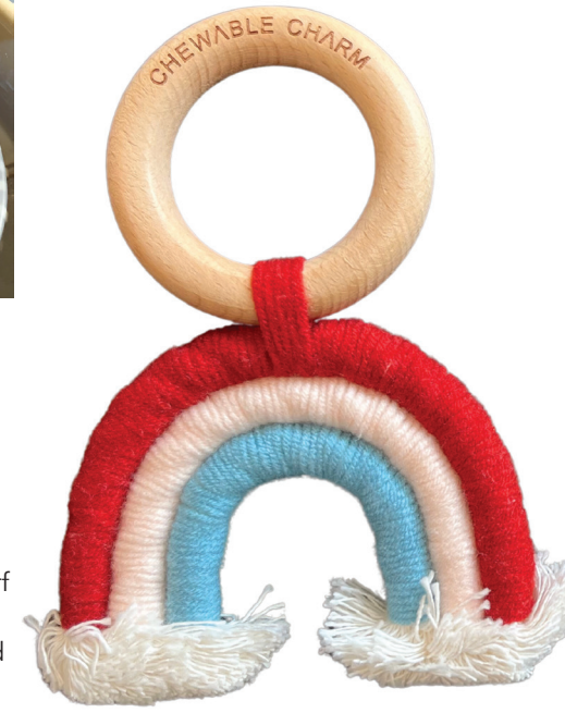
Rainbow Macrame Teether at Cactus Jane Emporium