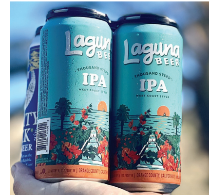
A four-pack from Laguna Beer

For friends and family members who love craft beer, grab a FOUR-PACK of 16-ounce cans of Laguna Beer—which was founded by two local friends and recently changed its name from Laguna Beach Beer Co.—filled with IPA, blonde ale, lager or other types of brew, from $14, depending on the type, at Laguna Beer. (949-715-0805; lagunabeer.com)