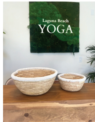
Woven Baskets at Laguna Beach Yoga & Fair Trade