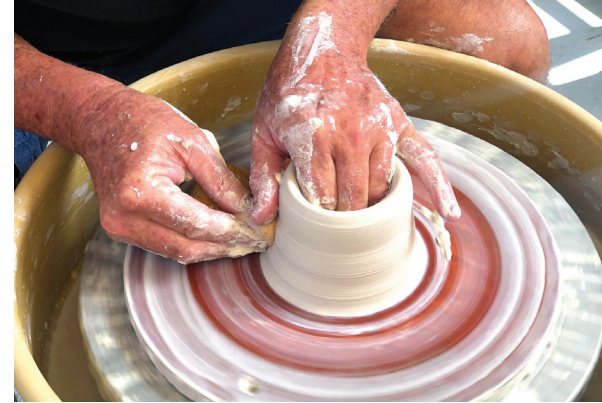
Art Classes at Sawdust Art Festival