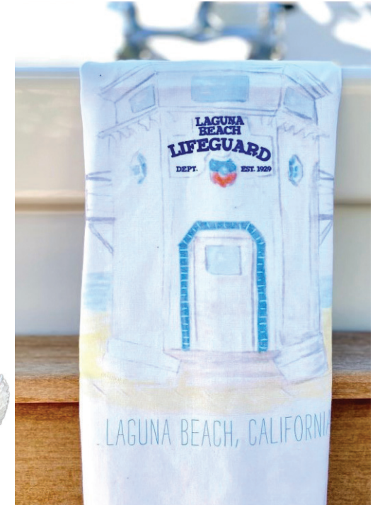
Laguna Beach Bar Towel at Bushard's Pharmacy