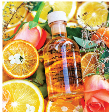
Body & Massage Oil at Spa Montage

To make a difference with a stylish gift, these WOVEN BASKETS with white beads along the top edge are ideal for decor or storage. They are handmade by artisans in Tanzania through a fair trade partnership with The Peace Exchange—a Laguna Beach-based nonprofit—and come in different sizes, from $25, at Laguna Beach Yoga & Fair Trade or on The Peace Exchange website. (949-312-1357; thepeaceexchange.com)