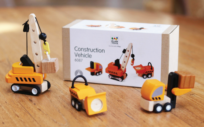
Construction Vehicles by PlanToys at Eco Now