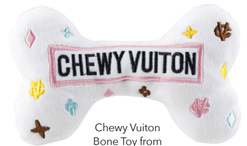
Chewy Vuiton Bone Toy from Naked Dog Bistro

For those who want to take their photography below the ocean's surface, SeaLife's REEFMASER RM-4K takes 14 megapixel still images and 4K video with a compact camera that can be removed from its waterproof housing and features an easy, four-button control system as well as Wi-Fi connectivity, $349.95, at Beach Cities Scuba. (949-494-6965; beachcitiescuba.com)