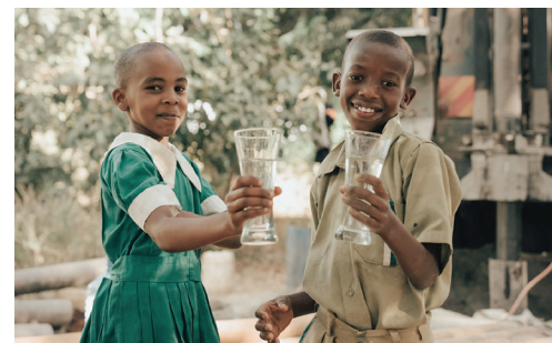
With My Own Two Hands helps provide access to clean water, sustainable agriculture and education in Africa.

WYLAND FOUNDATION Marine wildlife artist Wyland—known for his large-scale whale murals across the globe—established the Wyland Foundation more than 25 years ago to help preserve the world's waterways. Among this organization's educational programs is the Clean Water Mobile Learning Experience and a conservation-focused student art contest, while also encouraging waterway cleanups and partnering with mayors nationwide for a friendly competition to see which city can be the most water-wise. (wylandfoundation.org) ■