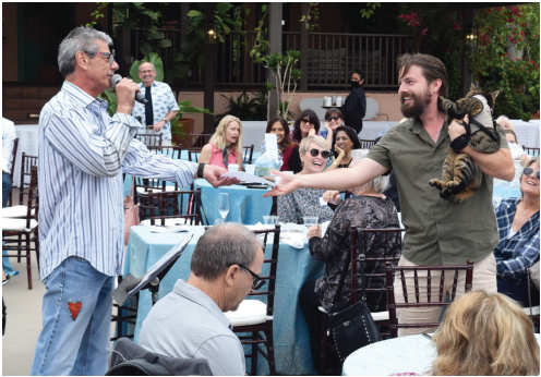
The Blue Bell Foundation for Cats fundraiser

BLUE BELL FOUNDATION FOR CATS, THE For more than 30 years, The Blue Bell Foundation for Cats has helped provide shelter and care for senior cats whose owners pass away or can no longer take care of them. The Laguna Canyon property is a sanctuary for the pets that live there. Set amongst fresh greenery and gardens, the cats live cage-free with perches and comfortable beds, high-quality food, screened-in porches, around-the-clock health care and more. (bluebellcats.org)