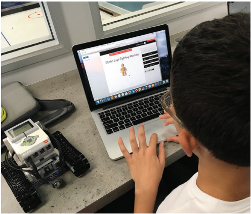
Boys & Girls Club of Laguna Beach

A wide range of nonprofits are working hard to benefit the community, from helping the homeless to assisting animals, advocating for the arts and preserving our open spaces. And as the year comes to an end, many residents look to make a difference for those in need or support a cause that’s important to them. To encourage this giving spirit, we’ve compiled a roundup of organizations in the Laguna Beach area that could use your donation of money, supplies or volunteer hours. Read on to find a charity that would be grateful for your support this season.