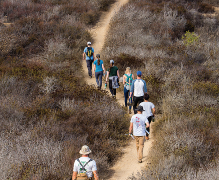
Clockwise from top: Laguna Art Museum; a volunteer trail work day organized by Laguna Canyon Foundation; Laguna Beach Community Clinic