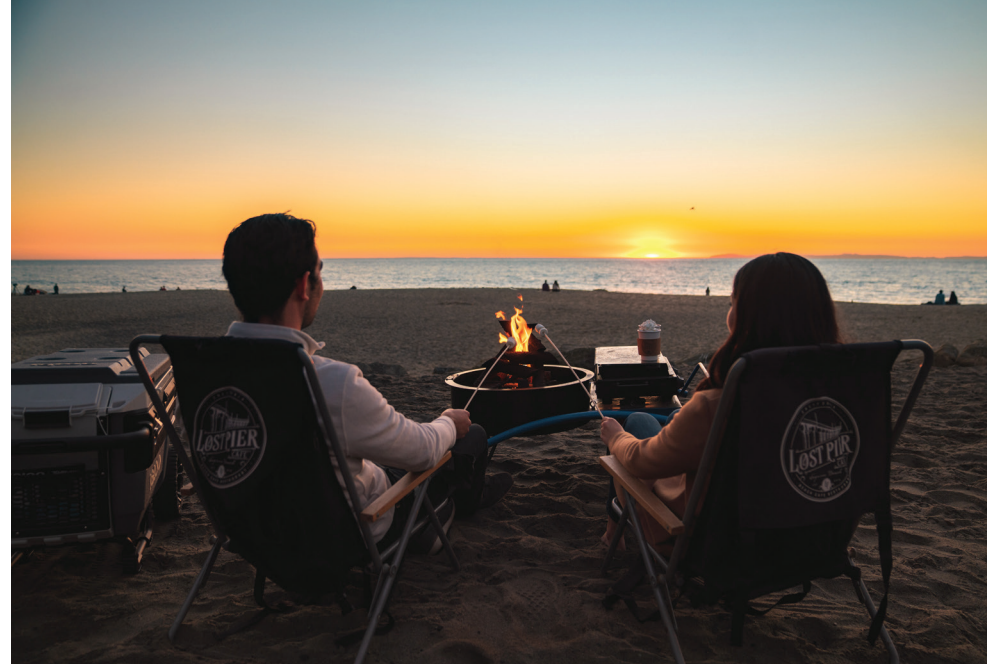
From top: roasting marshmallows with portable fire pits that can be rented at Lost Pier Cafe; stunning sunset views from Splashes Restaurant at Surf & Sand Resort