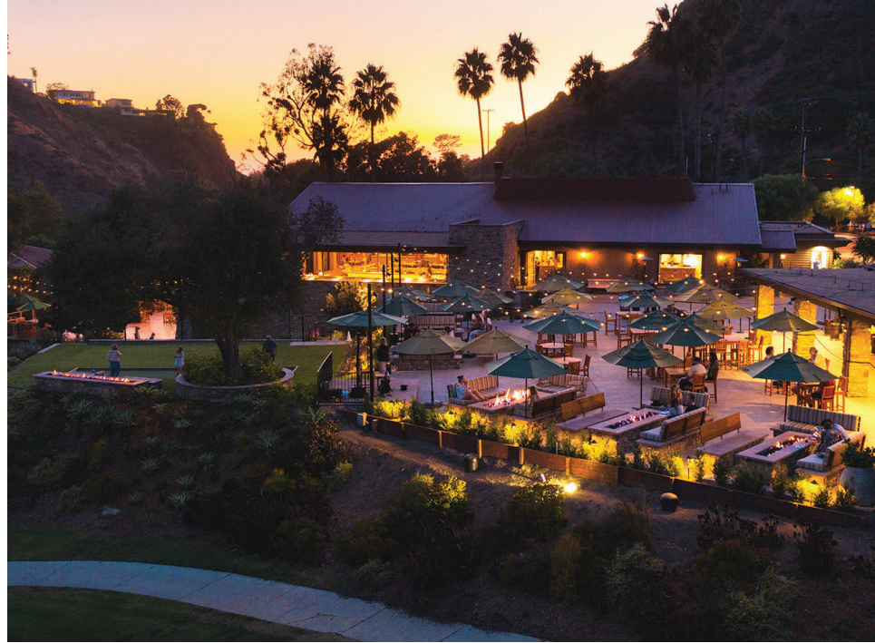
The Porch (left) at The Ranch at Laguna Beach and some of the eatery’s fire pits where appetizers, wine, cocktails and more are served (below)