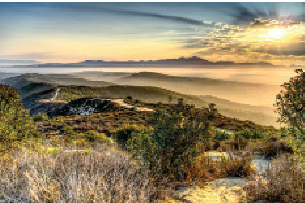
Hike at Top of the World for impressive views of the rolling hills.