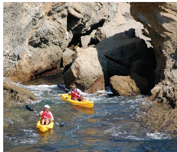
Kayaking with La Vida Laguna, which offers tours