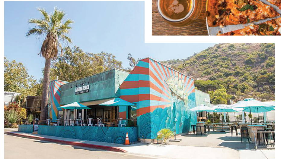
Laguna Beach Beer Co.’s patio and some of its pizza and beer (inset)

At 230 Forest Avenue , you can find everything from oysters, beetroot salmon crudo, and shrimp and scallop ceviche to pork chops, lush salads and skirt steak. The eatery also serves handcrafted cocktails, which can also be enjoyed out on the parklets, with unique drinks like a fig margarita, blood orange paloma and Oaxacan wildflower martini.