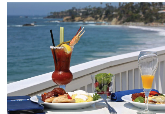
An ocean-view breakfast at The Cliff, including one of the eatery's over-the-top bloody marys

Patios with a view are abundant in Laguna, and they never disappoint. Las Brisas near Heisler Park has an alfresco dining area that overlooks the blue waters of the Pacific, sprawling Main Beach and the park itself—a gorgeous spot, and a favorite for those that live in town as well as those visiting from elsewhere. The Mexican-inspired fare and seafood delights are delicious and just enhance the views.