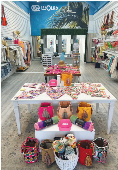
Las Olas offers swimwear and accessories.