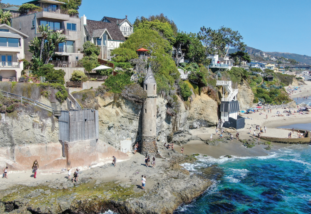
Victoria Beach and the iconic “pirate tower”