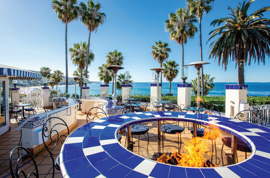
Patios at Las Brisas (above), The Deck on Laguna Beach (above right) and Sapphire, Cellar-Craft-Cook (left)