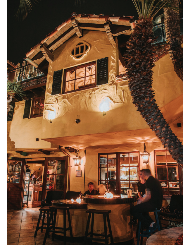
Skyloft's rooftop (above) and drinks (left); right: Mozambique's fire pit; below: the patio at The Cliff

being part of a hotel experience sets it apart from the other sky-high eateries in town. "As awesome as those are, I have an affinity for any elevated hotel-related bar experience," he explains. Grab a fruity cocktail or a cold glass of wine to sip in the sunshine, paired with shared plates that your whole group can enjoy together.