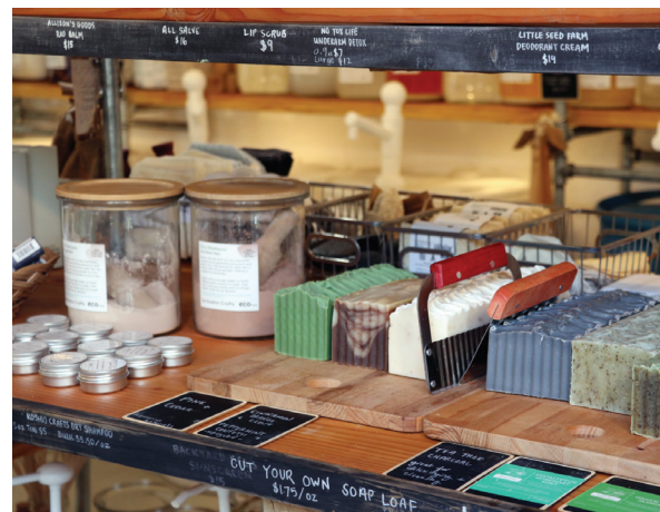
Eco Now is a new store downtown that offers sustainable household goods without packaging.

With its Marine Protected Areas and status as a water-wise city, Laguna Beach has already made its mark as an environment-friendly locale, but the new Eco Now store downtown is helping take that a step further. Located in the Lumberyard Mall, the shop offers eco-friendly, handmade and locally sourced household goods made from biodegradable materials, all in an effort to provide sustainable options and reduce waste; bring your own reusable containers or purchase one from the store. In addition, Eco Now hosts monthly sustainability workshops on things like composting, fixing things and cleaning up the community in order to educate locals on what they can do to help the planet. A grand opening celebration and ribbon cutting ceremony was held in early March, though this isn't owner Thea Merritt-Pauly's first retail venture. Eco Now originally set up shop at Orange County farmers markets in 2018 and there are now permanent stores in Costa Mesa and Anaheim as well as a shop reopening in a new location this spring in Riverside. (949-715-0632; econowca.com) —A.R.