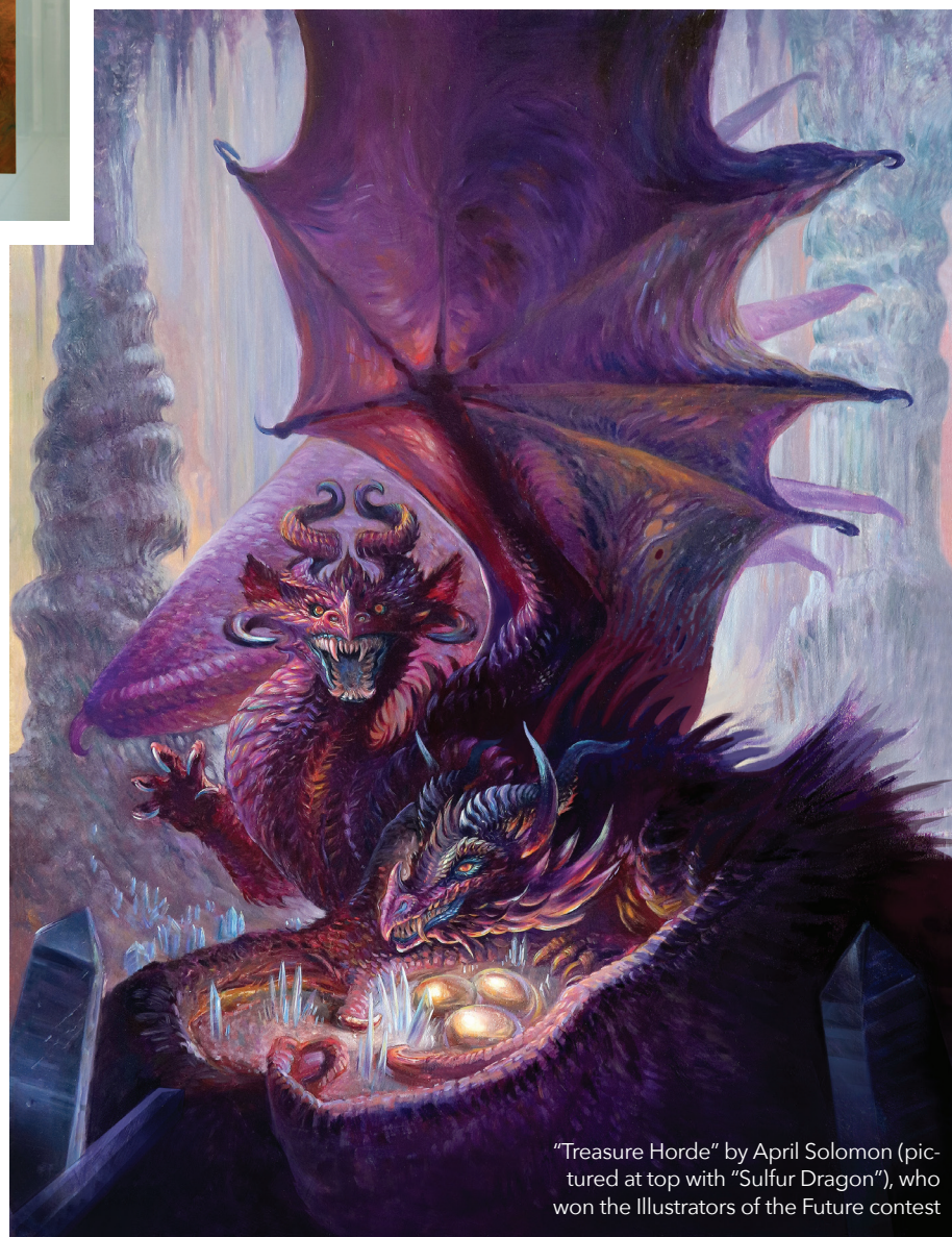
“Treasure Horde” by April Solomon (pictured at top with “Sulfur Dragon”), who won the Illustrators of the Future contest