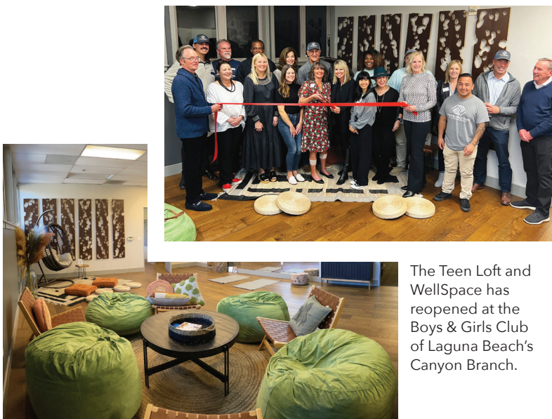
The Teen Loft and WellSpace has reopened at the Boys & Girls Club of Laguna Beach's Canyon Branch.