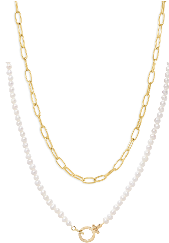
The Parker Mini (top) and Parker Pearl necklaces by gorjana, which were donated to Dress for Success