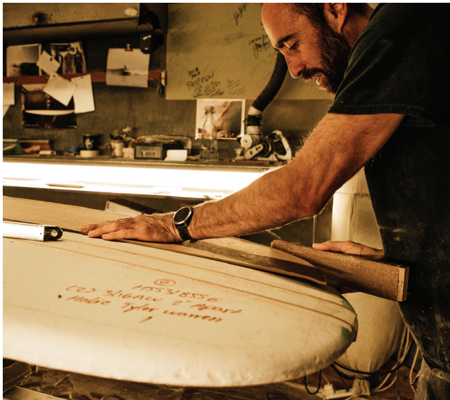
New experiences at The Ranch at Laguna Beach include The Shaper (left) and The Painter (right).