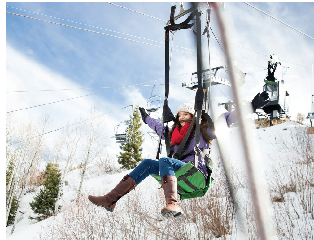
When not hitting the slopes, visitors can get their adrenaline going with activities like zip lining at Utah Olympic Park.

But spring, summer and fall have plenty to offer travelers as well, from river rafting, fishing, hiking, zip lining and mountain biking to events like the Park City Song Summit, the Miner's Day Parade, Autumn Aloft hot air balloon experience and the Kimball Arts Festival. No matter when you visit, you're sure to find the magic that makes Park City what it is—a uniquely warm destination filled with history, culture, arts and beyond. ■