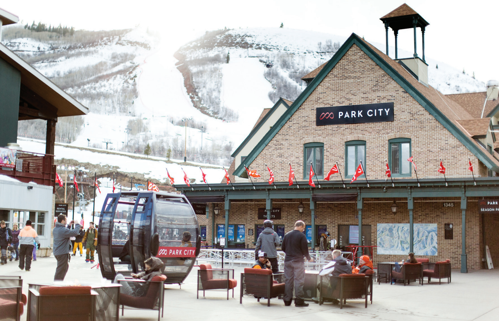
Canyons Village, an area with restaurant and shops that is steps away from Park City Mountain Resort