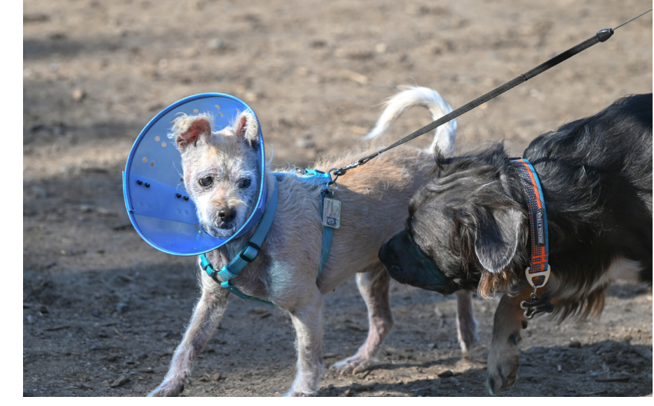
Above and right: Dogs greet each other at the Laguna Beach Dog Park.

Over the last three decades, the park continues to be a haven for Laguna residents to get outdoors, exercise their dogs and enjoy the natural canyon setting. Nestled up next to the hills, the fenced-in park features a sprawling meadow split into two sections,