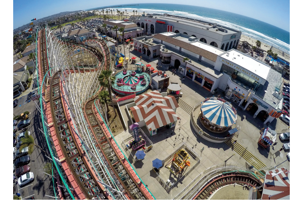
The beachfront Belmont Park is home to rides, restaurants and shopping opportunities.

According to Tapp, families can also enjoy the luxury of convenient in-room dining. And, on warm, sunny days, Lawler says the area is ideal for an outdoor picnic. "The Bahia has a secluded beach for our guests so that would be a perfect place for a picnic," she says. "The surrounding Mission Bay Park does have some picnic tables scattered through the area and also bonfire pits, if anyone would like to have a barbecue off property."