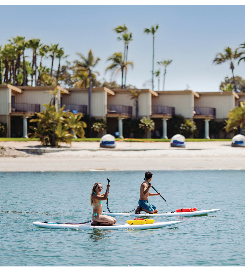
Paddleboarding offshore at Bahia Resort Hotel.

can enjoy boardwalk-themed thrills at Belmont Park. The historic amusement park first opened in the 1920s and has since been expanded to offer even more excitement. One of the main attractions is the Giant Dipper, a wooden roller coaster that has been in place since the park's early days. Reaching heights of 75 feet, children will love the twists, turns and drops, while parents can delight in sprawling coastal views. Other thrill rides, like Beach Blaster and Control Freak, will keep teens entertained, and younger children can enjoy a Tilt-A-Whirl, Liberty Carousel and Belmont Express mini train.