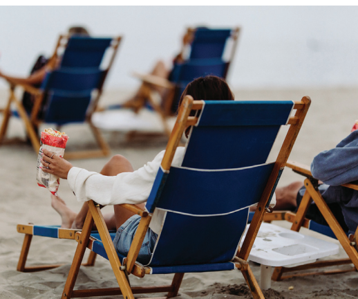
Family-friendly Movies on the Bay (bottom) and poolside dining (top) are available at the Catamaran.