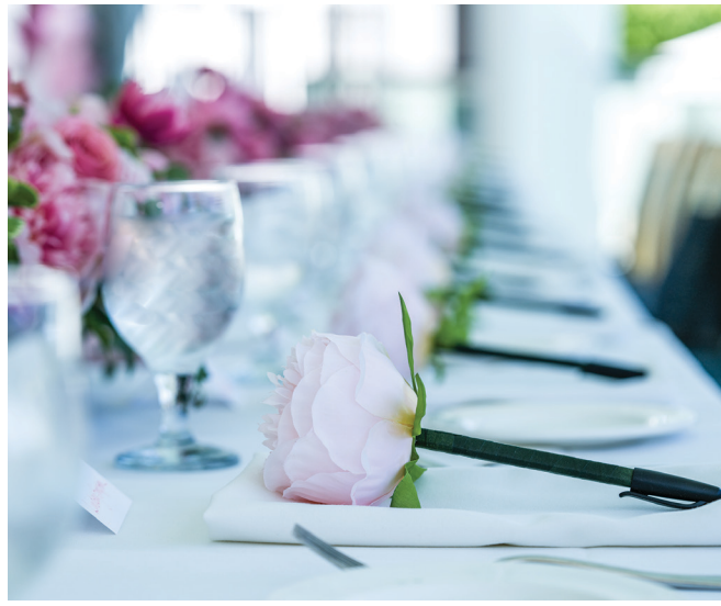
CONTACT US TO SCHEDULE A CATERED EVENT OF YOUR OWN AT BRENTWOOD COUNTRY CLUB.